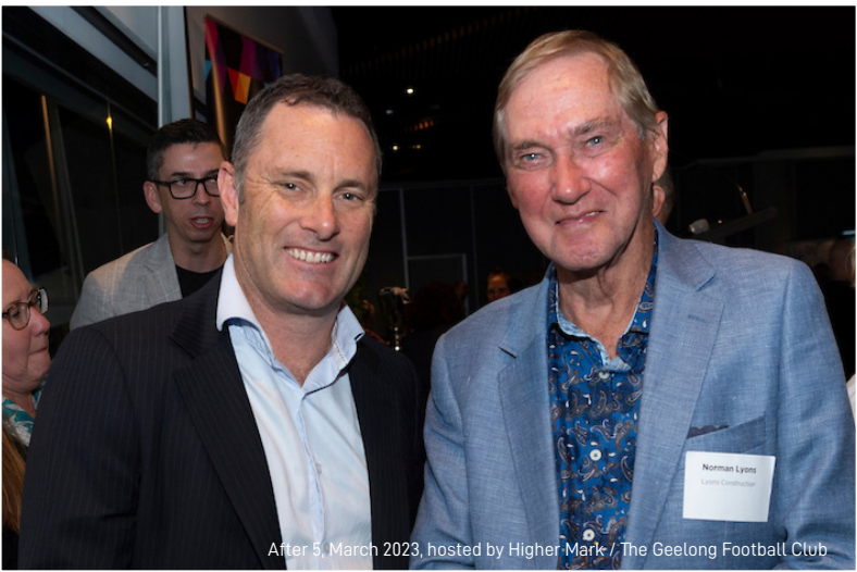
After 5, March 2023, hosted by Higher Mark / The Geelong Football Club