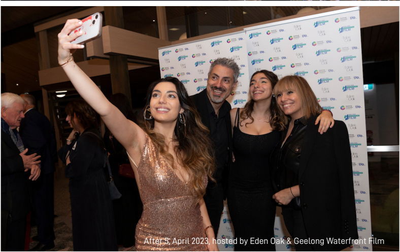
After 5, April 2023, hosted by Eden Oak & Geelong Waterfront Film