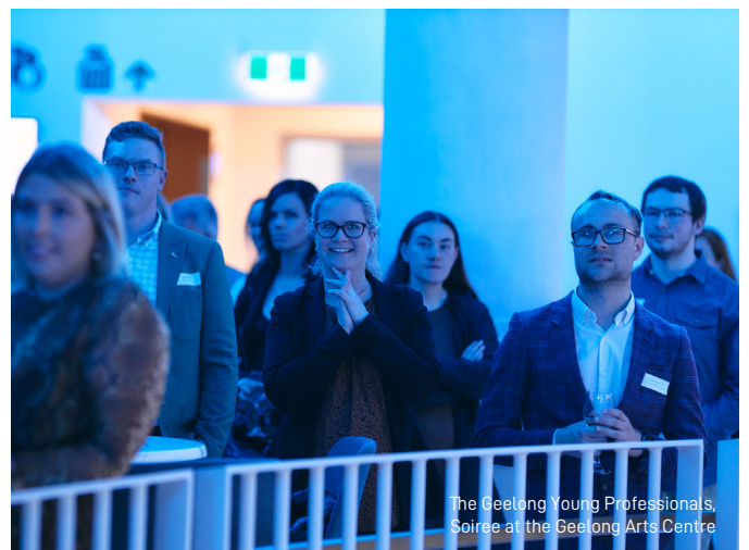
The Geelong Young Professionals, Soiree at the Geelong Arts Centre