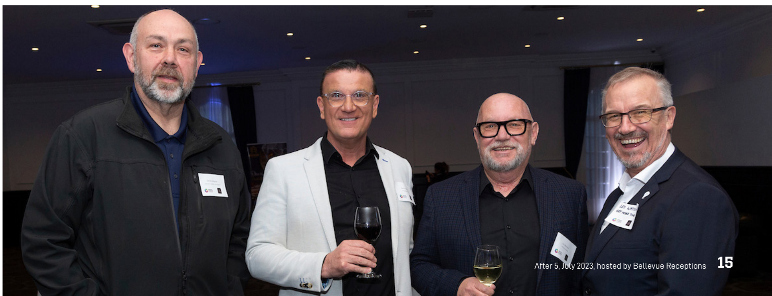
After 5, July 2023, hosted by Bellevue Receptions