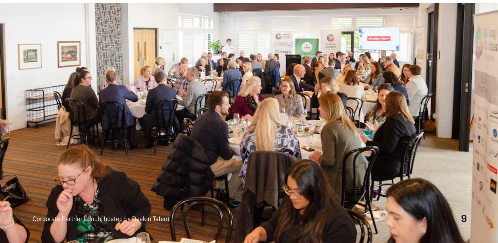
Corporate Partner Lunch, hosted by Deakin Talent