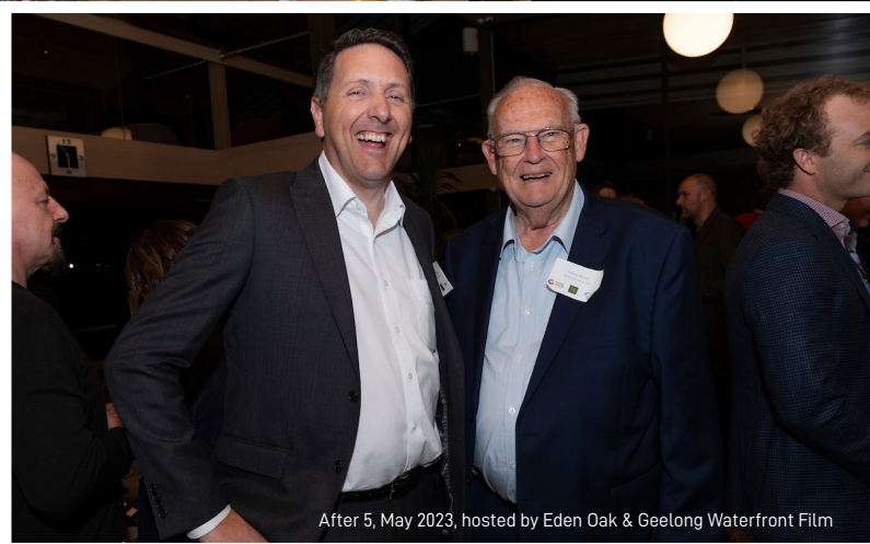
After 5, May 2023, hosted by Eden Oak & Geelong Waterfront Film