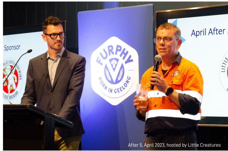
After 5, April 2023, hosted by Little Creatures