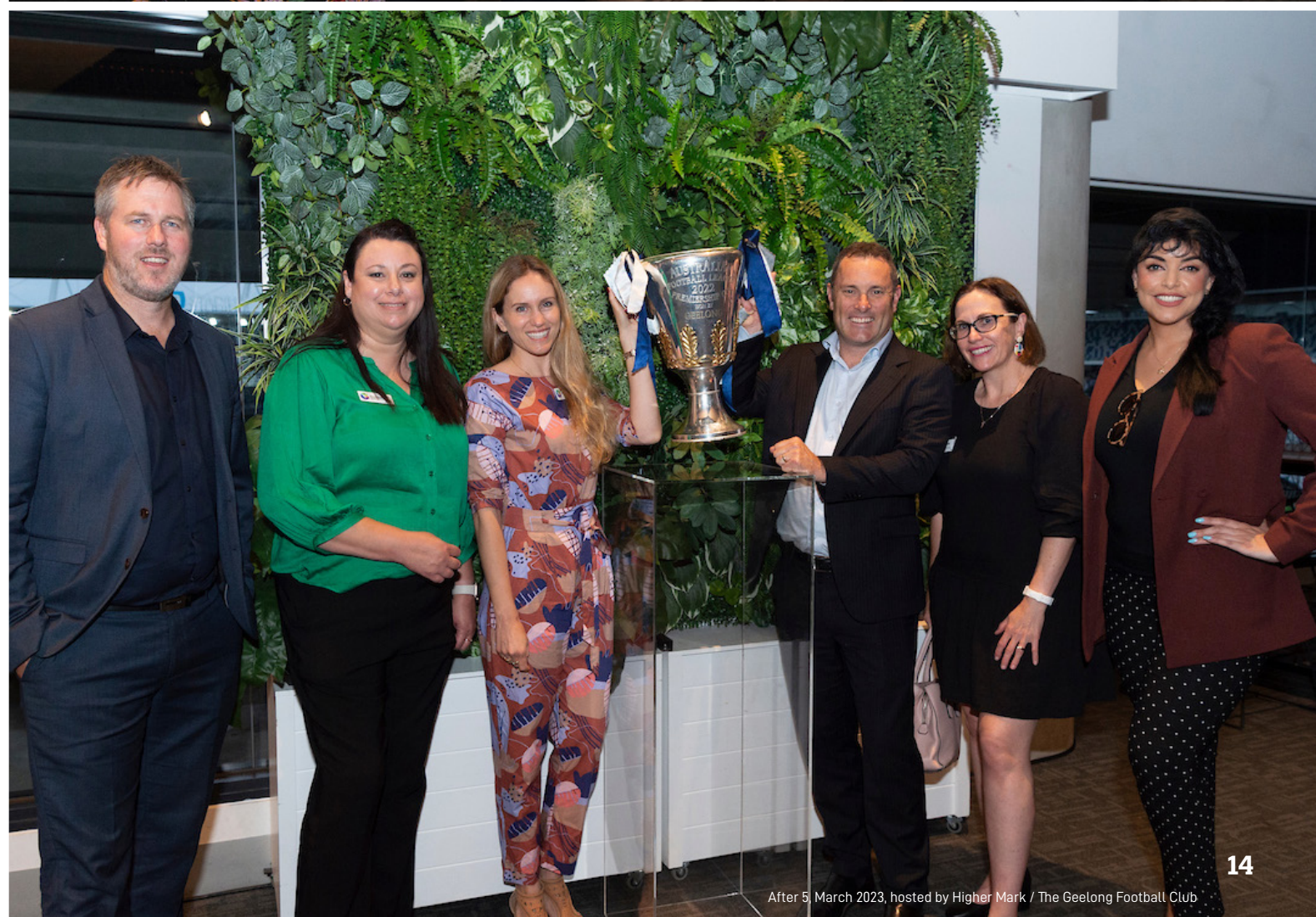
After 5, March 2023, hosted by Higher Mark / The Geelong Football Club