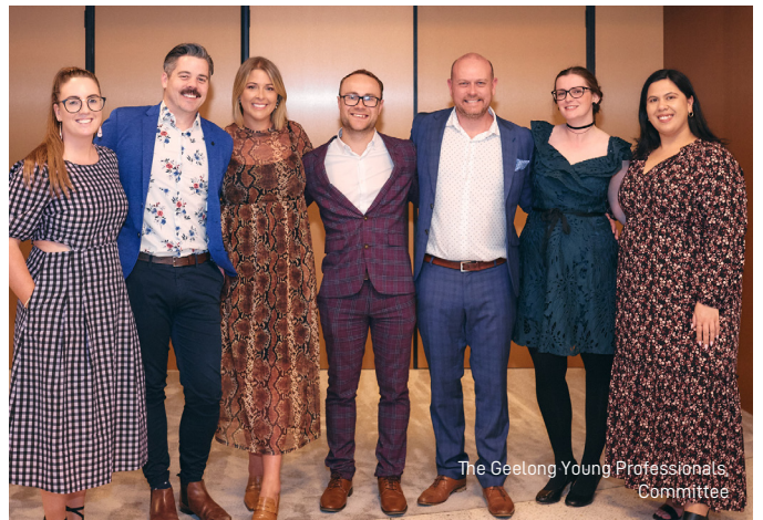
The Geelong Young Professionals Committee