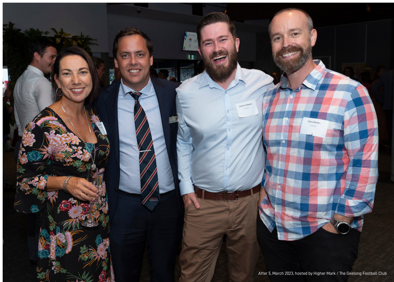
After 5, March 2023, hosted by Higher Mark / The Geelong Football Club