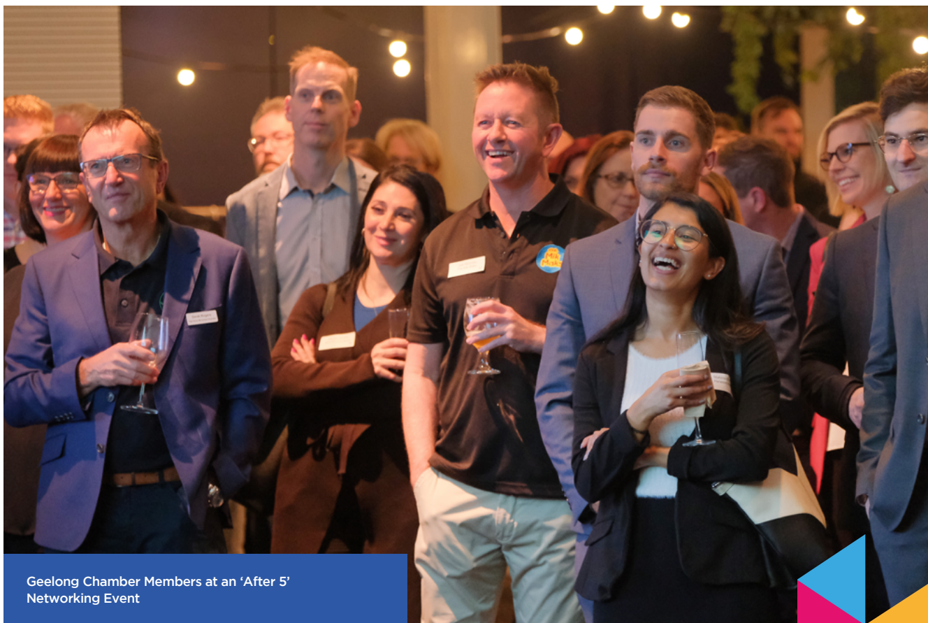
Geelong Chamber Members at an 'After 5' Networking Event