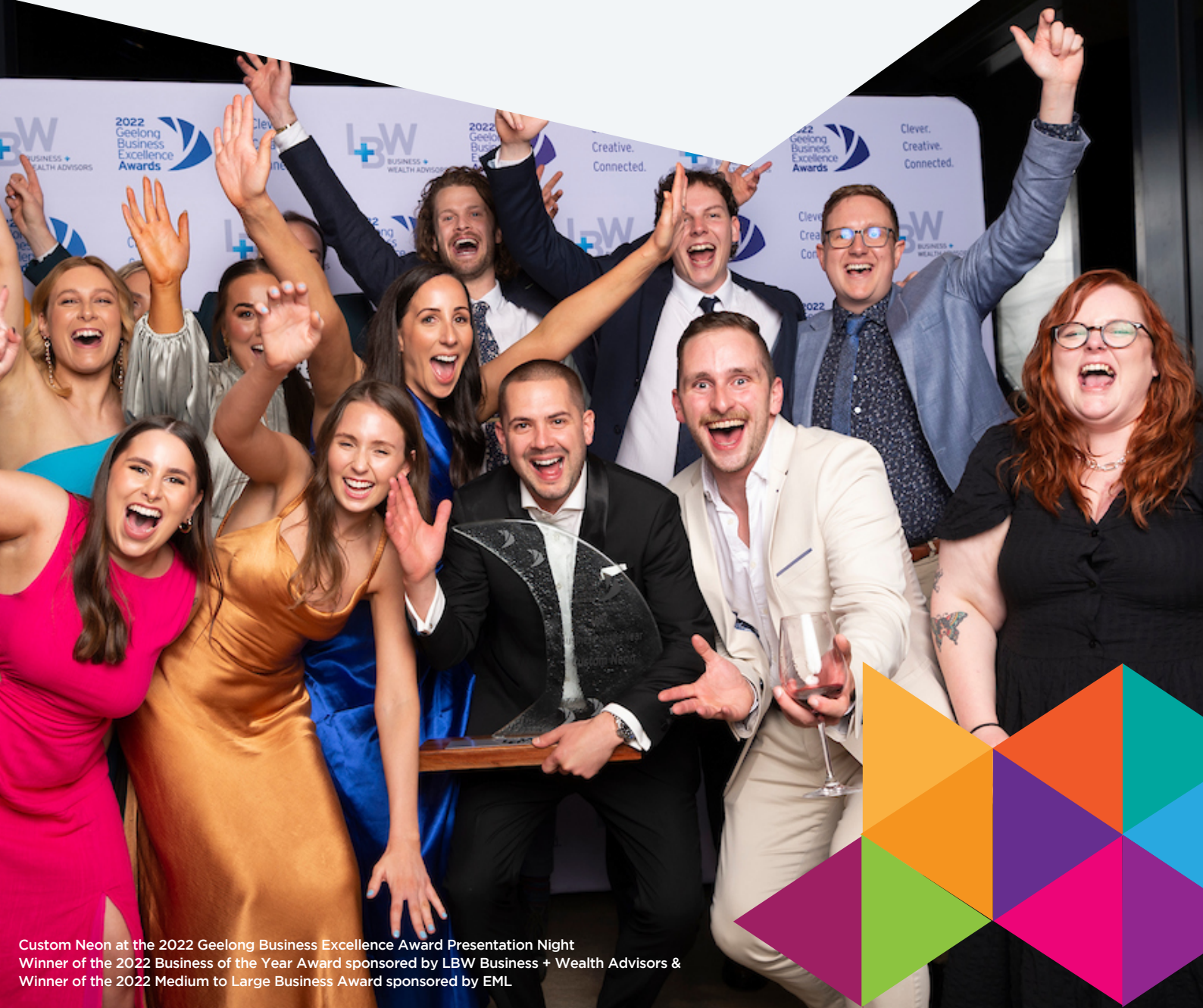
Custom Neon at the 2022 Geelong Business Excellence Award Presentation Night Winner of the 2022 Business of the Year Award sponsored by LBW Business + Wealth Advisors & Winner of the 2022 Medium to Large Business Award sponsored by EML

Join Geelong's Most Active Business Community